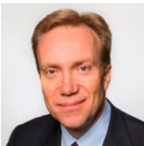
Børge Brende MINISTER OF FOREIGN AFFAIRS

We welcome the global engagement to work towards fulfilling the 2030 Agenda. It is our responsibility to build economically, socially and environmentally sound societies for both current and future generations.