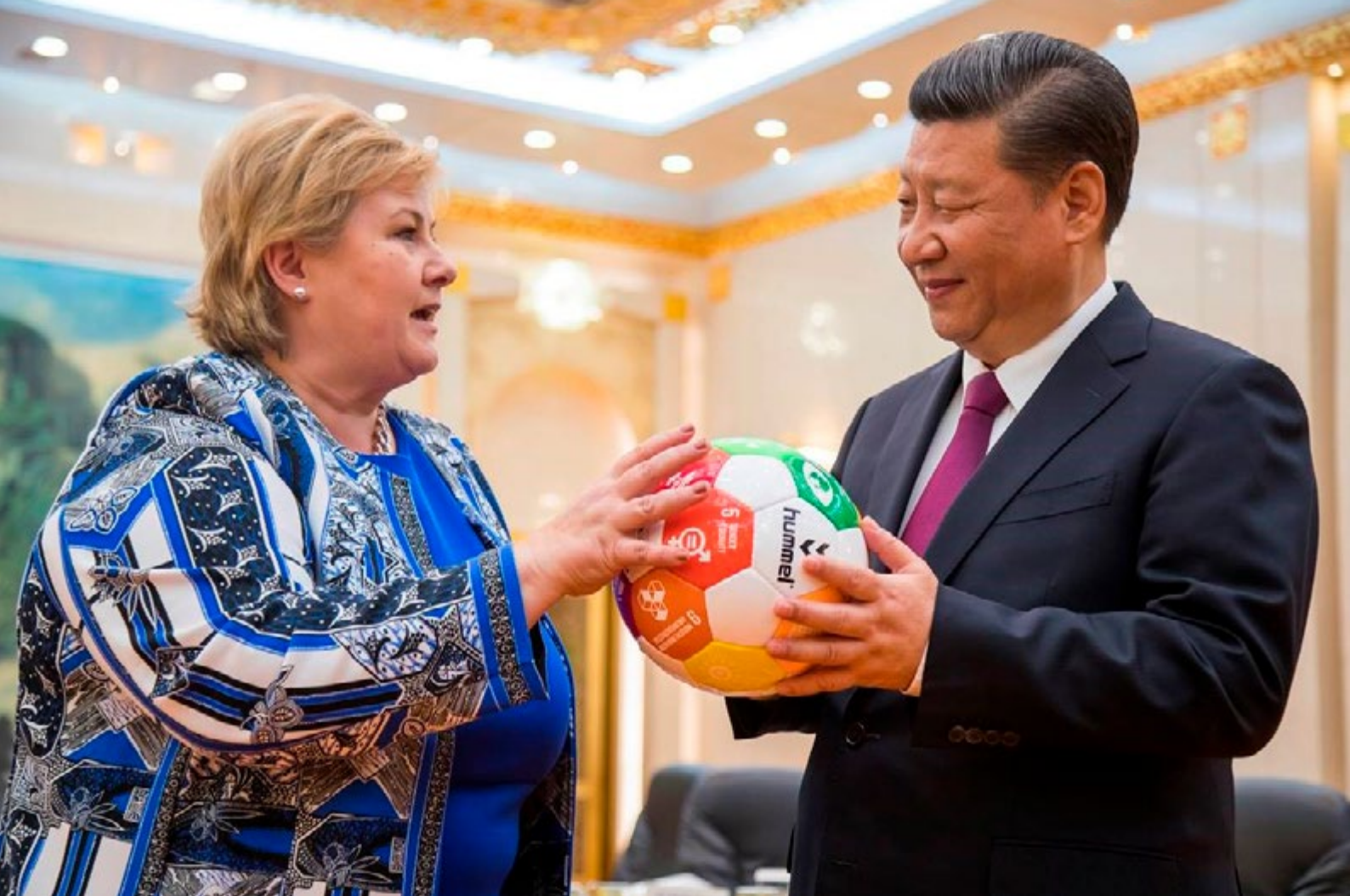
Prime Minister of Norway, Erna Solberg, meeting with President Xi Jinping in China in April 2017. The Prime Minister brought a soccer ball with the 17 Sustainable Development Goals as a gift to the President. This summer, thousands of children and youth will use identical soccer balls at Norway Cup.