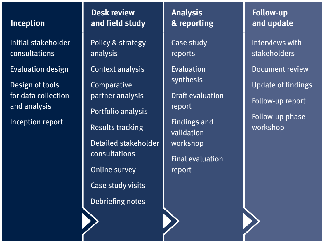
Figure 2: Key phases and activities of the evaluation