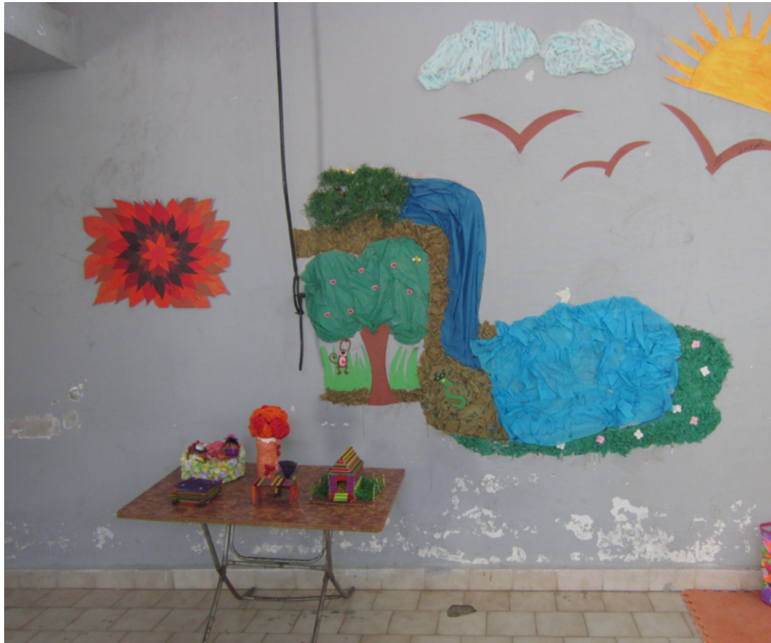
Children's artwork at informal learning centre, Lebanon