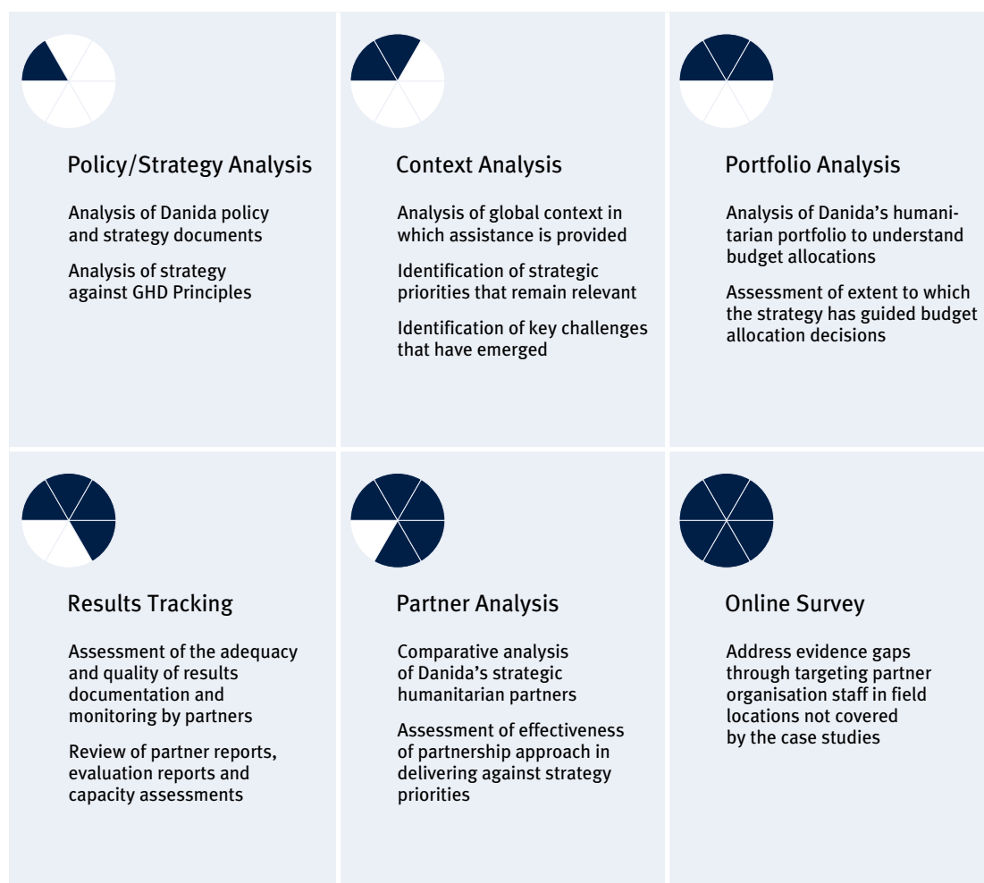
Figure 1: Methodological building blocks

The participatory and learning-focused approach described above was underpinned by a number of core methodological building blocks. Figure 1 below summarises these while Annex B describes each tool.