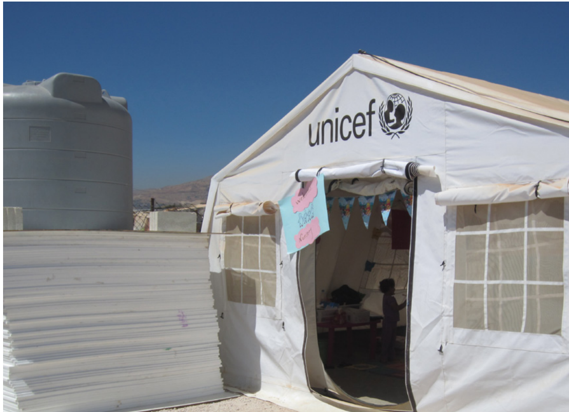
School in refugee settlement, Lebanon

Although Denmark has been extremely engaged in global-level policy discussions and with the boards of international organisations, currently, it does not have the capacity to be similarly active at field level. 39 The Syria case study highlighted that a lack of humanitarian field presence means that it was not engaged at country or regional level, even in the largest humanitarian crisis (although this is starting to change). Although Denmark has advocated on humanitarian issues during high-level visits to the region, partners strongly emphasised the need for it to engage in policy discussions and advocacy at country and/or regional level in order to balance the voices of more political donors. This would be an opportunity for Denmark to promote the principles of GHD, including the humanitarian principles and counter-balance the voices of more politicised donors. By contrast, Denmark was active in policy discussions and donor groups in South Sudan because there is a fragile states advisor with humanitarian expertise based in the country. This is an excellent example of what it can achieve with just one person, as long as the person has the right experience and profile. The Nairobi embassy also participates in humanitarian donor groups, focusing on Somalia and refugee issues in the Horn of Africa region, which is helpful.