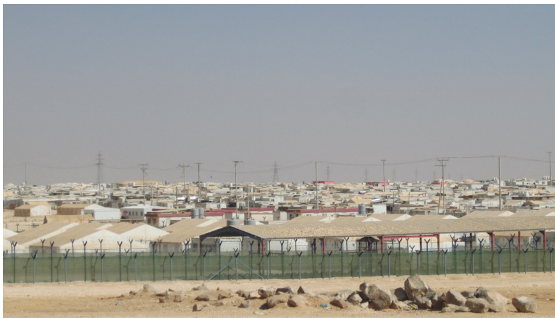
Za'atari Refugee Camp, Jordan

prioritised in 2014. 21 According to partners, in 2014, they were using Danida funding in 35 countries (including countries outside the priority crises where they were responding with flexible funds). 22