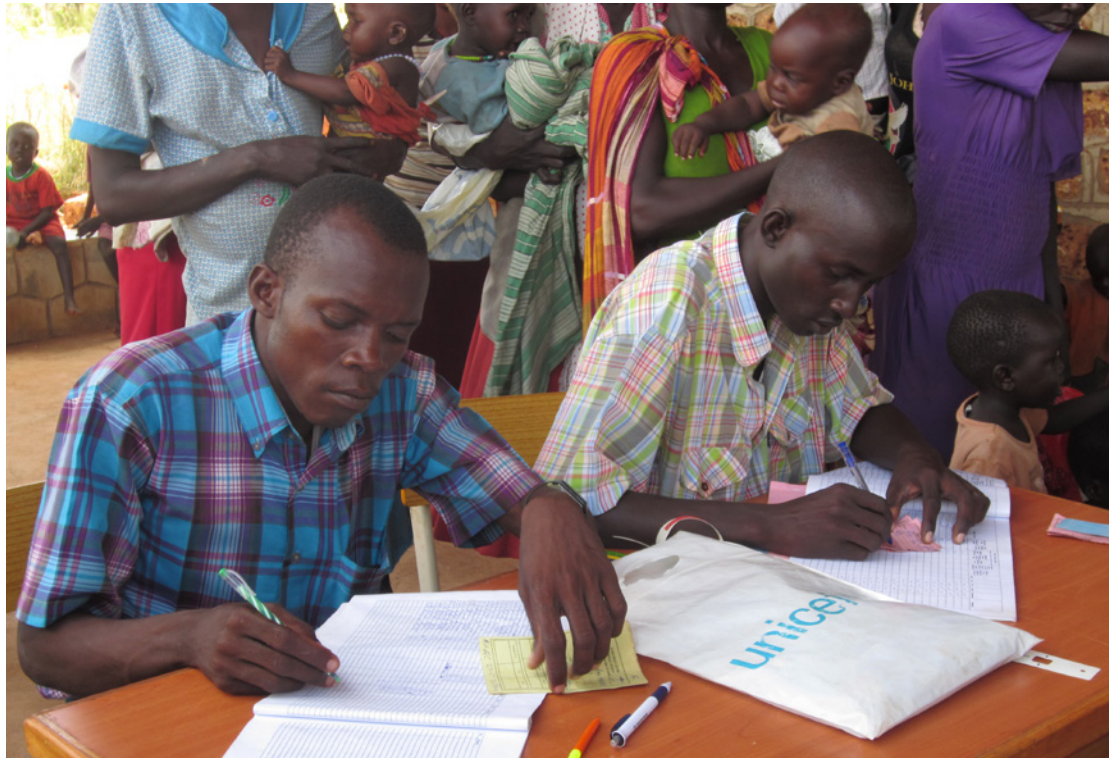
Registration at supplementary feeding programme, Wau, South Sudan