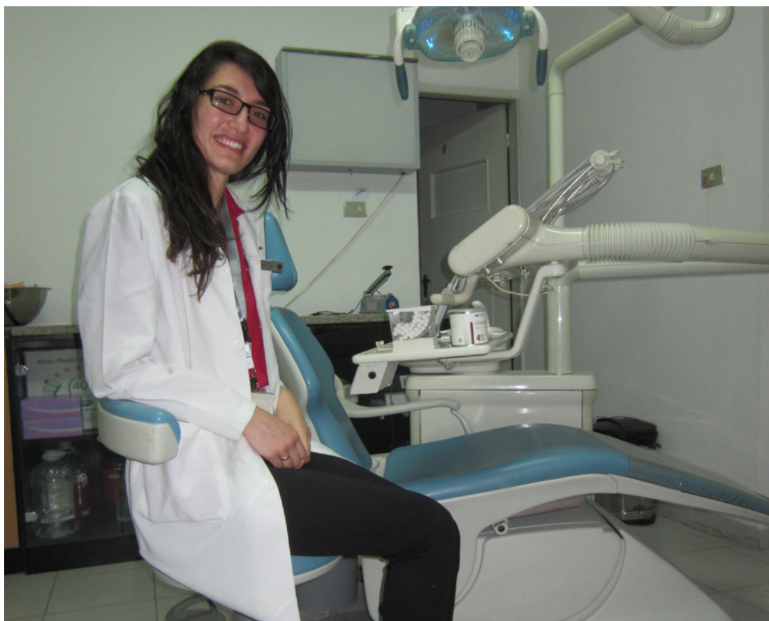
Dentist at Caritas Centre for Refugees, Amman, Jordan

Finally, partners value the fact that Danida is not simply a donor but a partner with which they can have honest discussions because its staff members are experienced and understand field realities and challenges.