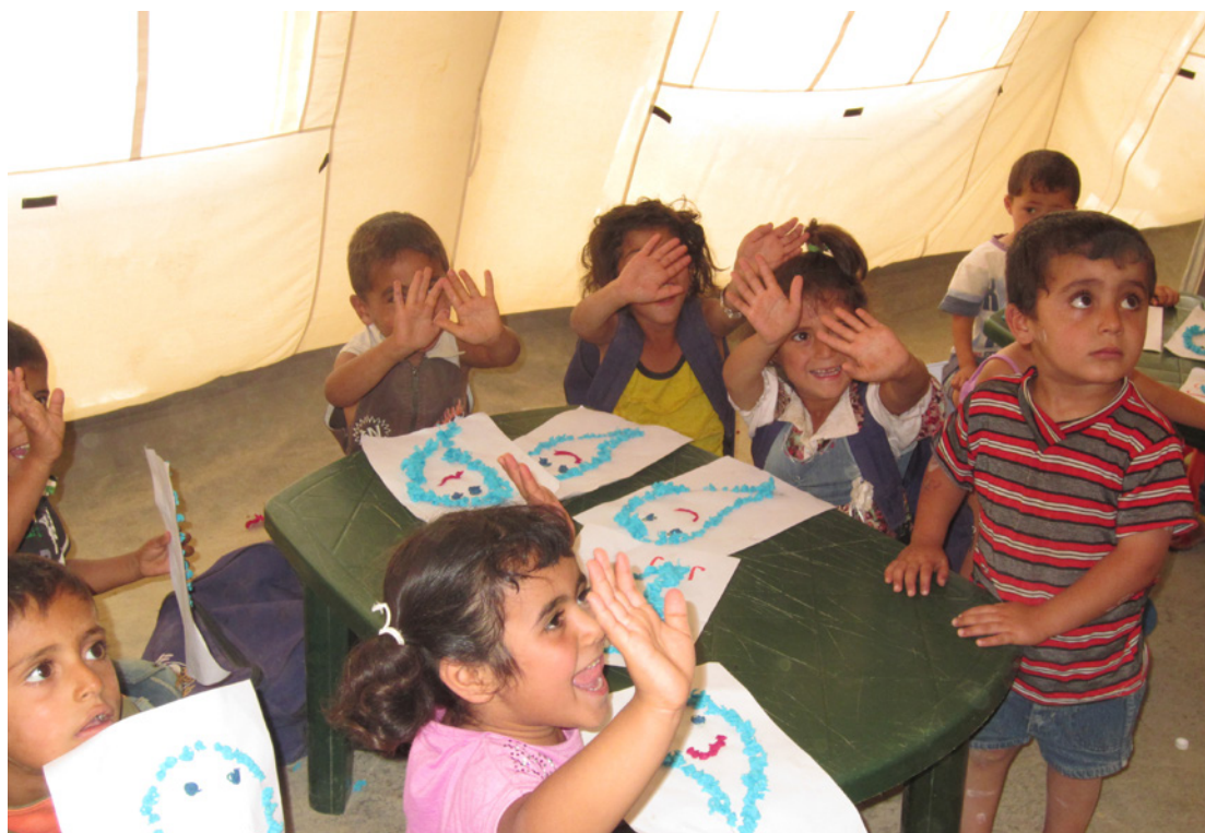
Children at school in refugee settlement, Lebanon

The evaluation found evidence that the Humanitarian Strategy remains relevant to the current humanitarian context. One indication is that, despite Danida granting its partners considerable flexibility in making programming decisions, in the comparative partner analysis, each organisation reported implementing a large number of the priorities (see Annex F). 12 The case studies also provided evidence of the relevance of the Strategy. For example, planning documents for the response to the Syria crisis reflect a number of the priorities, particularly the focus on vulnerability, protection, linking emergency and longer-term approaches, and the promotion of innovation. The focus on vulnerability has been relevant in Afghanistan, enabling Danida to combine longer-term assistance to refugees and internally displaced persons (IDPs) with emergency assistance to those affected by natural disasters and conflict. In addition, the initial broad consultations in preparation for the WHS have identified targeting assistance to the most vulnerable, resilience and respect for international humanitarian law as some of the critical issues to be addressed (see Section 3.4 in Annex D).