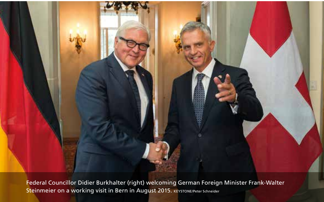
Federal Councillor Didier Burkhalter (right) welcoming German Foreign Minister Frank-Walter Steinmeier on a working visit in Bern in August 2015.

solidarity and cooperate. In so doing, it safeguards its foreign policy interests. This also applies in the case of counterterrorism and the fight against crime, where Schengen association offers valuable instruments such as the Schengen Information System and common standards on external border controls. Over and above this, Switzerland also works together closely with Europol, for example, with regard to foreign terrorist fighters.