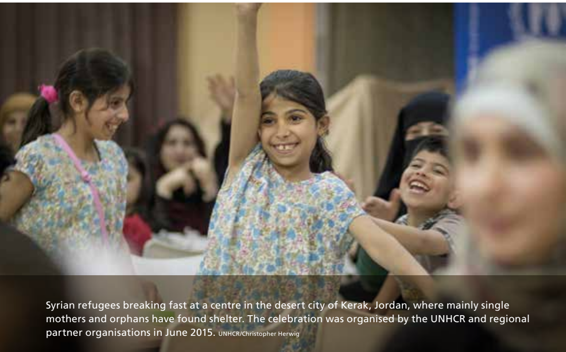
Syrian refugees breaking fast at a centre in the desert city of Kerak, Jordan, where mainly single mothers and orphans have found shelter. The celebration was organised by the UNHCR and regional partner organisations in June 2015.