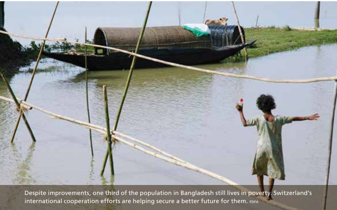
Despite improvements, one third of the population in Bangladesh still lives in poverty. Switzerland's international cooperation efforts are helping secure a better future for them.

into question. In a multipolar world, drawing up cooperative solutions for common challenges can at times be a very demanding task.