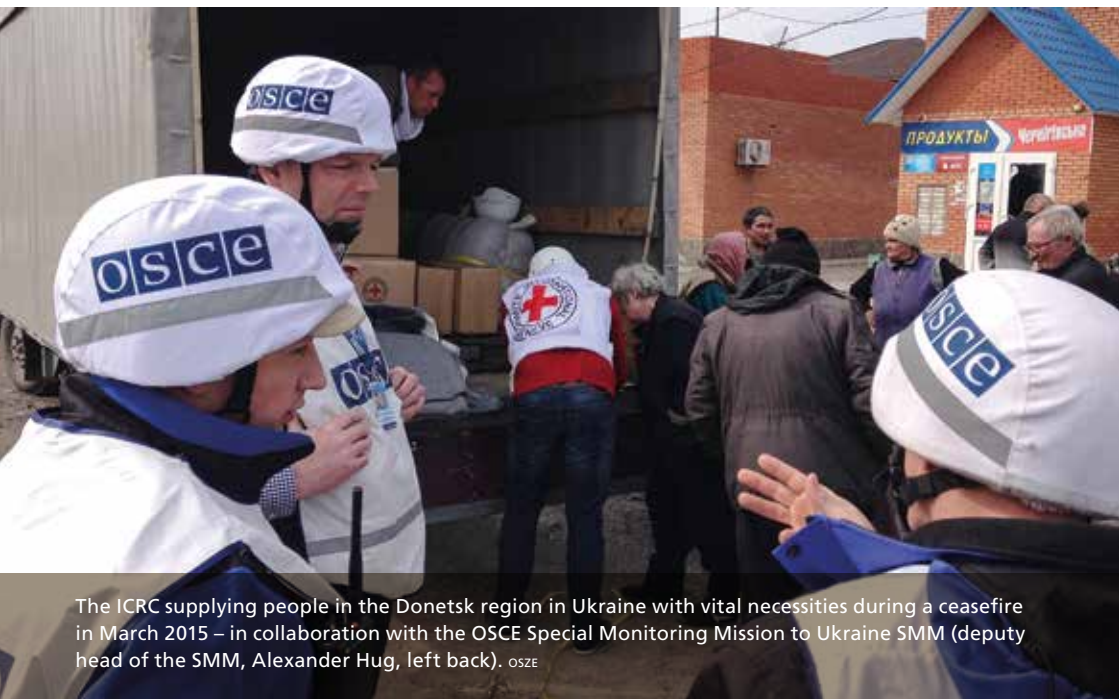
The ICRC supplying people in the Donetsk region in Ukraine with vital necessities during a ceasefire in March 2015 – in collaboration with the OSCE Special Monitoring Mission to Ukraine SMM (deputy head of the SMM, Alexander Hug, left back).

their regions of origin, providing support to countries of first refuge (such as Syria's neighbouring states), states on the Horn of Africa, and states in Eastern Europe in strengthening their protection and reception capacities. The aim is to reduce the pressure to make an onward journey to Europe by ensuring an efficient asylum system and better living conditions for migrants (protection, care, economic integration). In addition to bilateral and multilateral measures in the area of migration foreign policy, Switzerland also contributes via its humanitarian commitment to alleviating suffering on the ground, combating the causes of displacement through peacebuilding and development efforts, and working to ensure better management of migration towards Europe