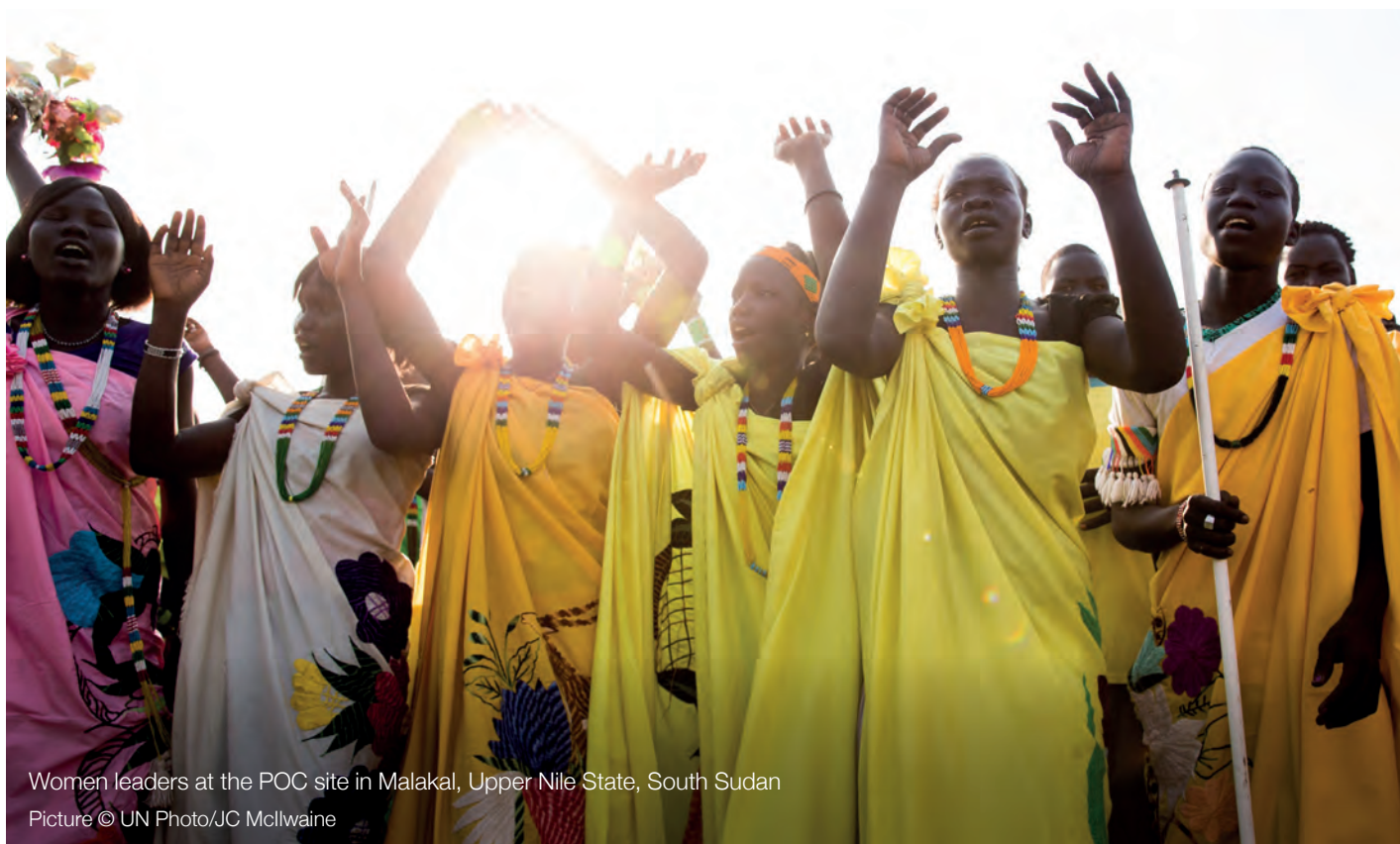
Women leaders at the POC site in Malakal, Upper Nile State, South Sudan