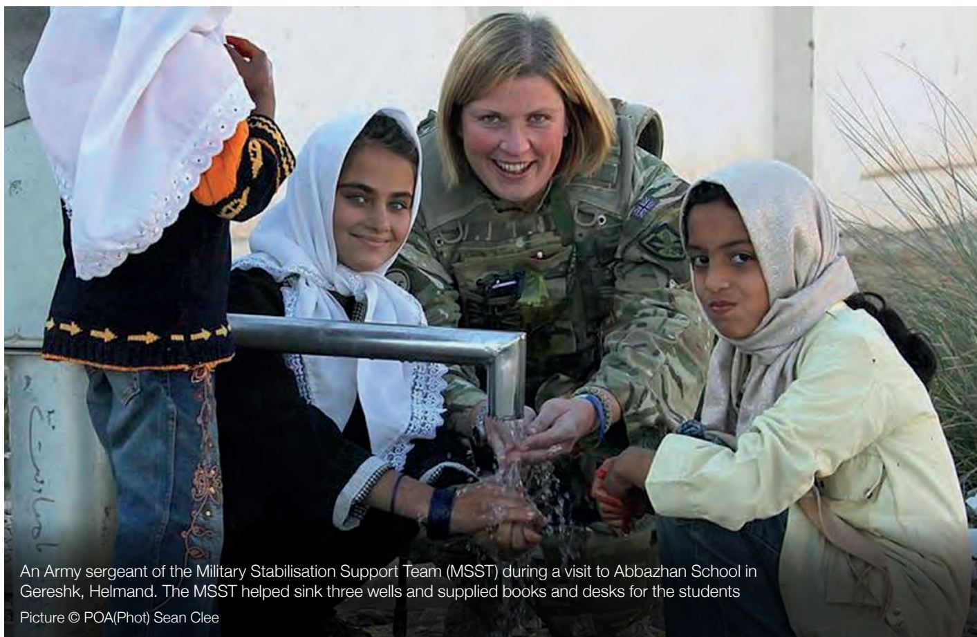
An Army sergeant of the Military Stabilisation Support Team (MSST) during a visit to Abbazhan School in Gereshk, Helmand. The MSST helped sink three wells and supplied books and desks for the students