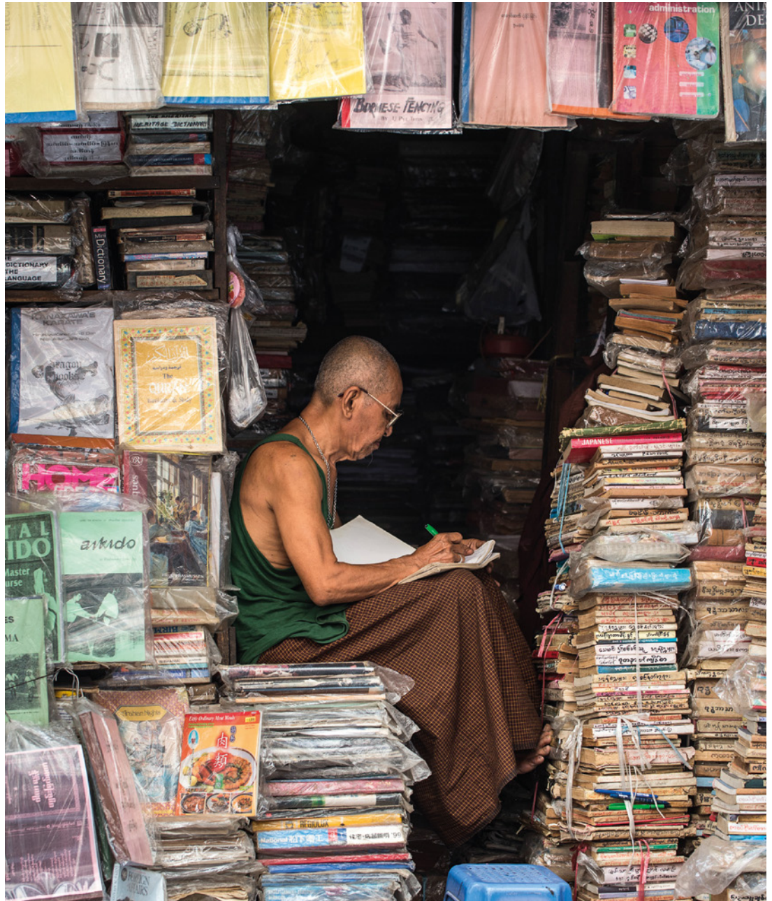
Democratisation in Burma: Owner of a bookstore, 2013.