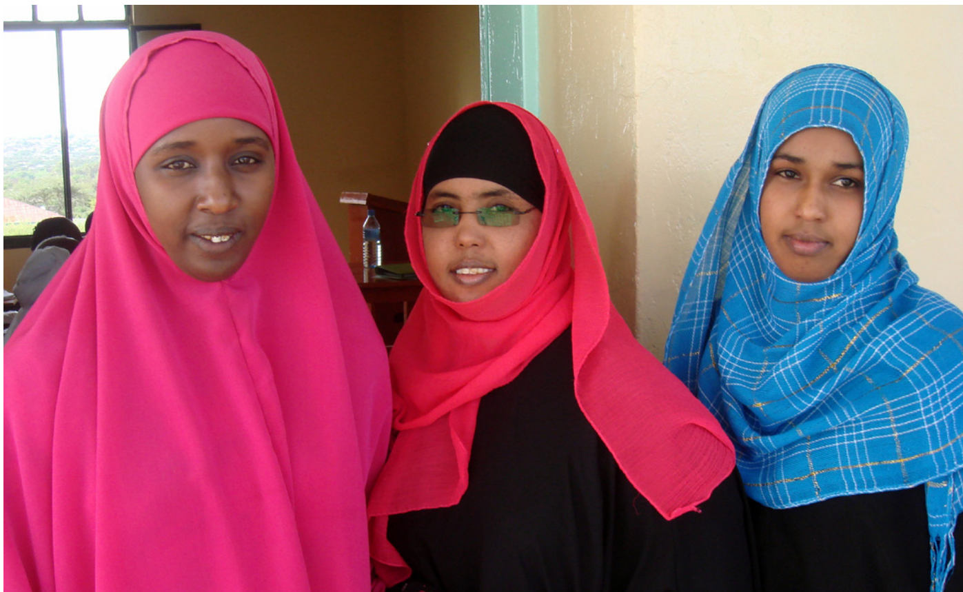
First women to graduate as prosecutors from Hargeisa University, Somaliland, 2011.