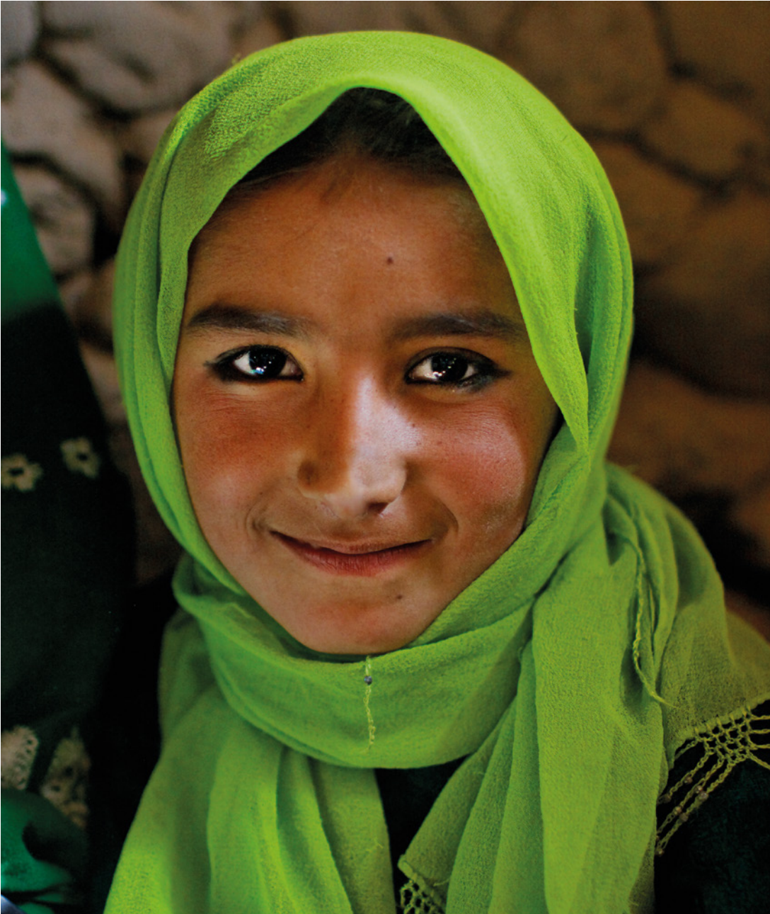
Afghan girl , Feyzabad, Afghanistan, 2008.