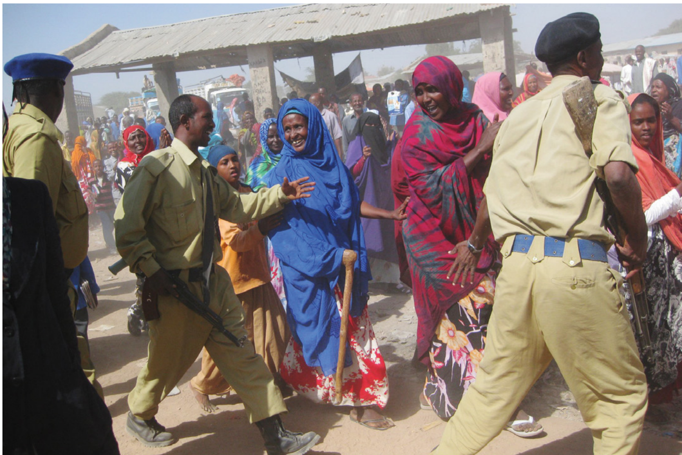
Livestock market in Hargeisa, Somaliland, 2010.