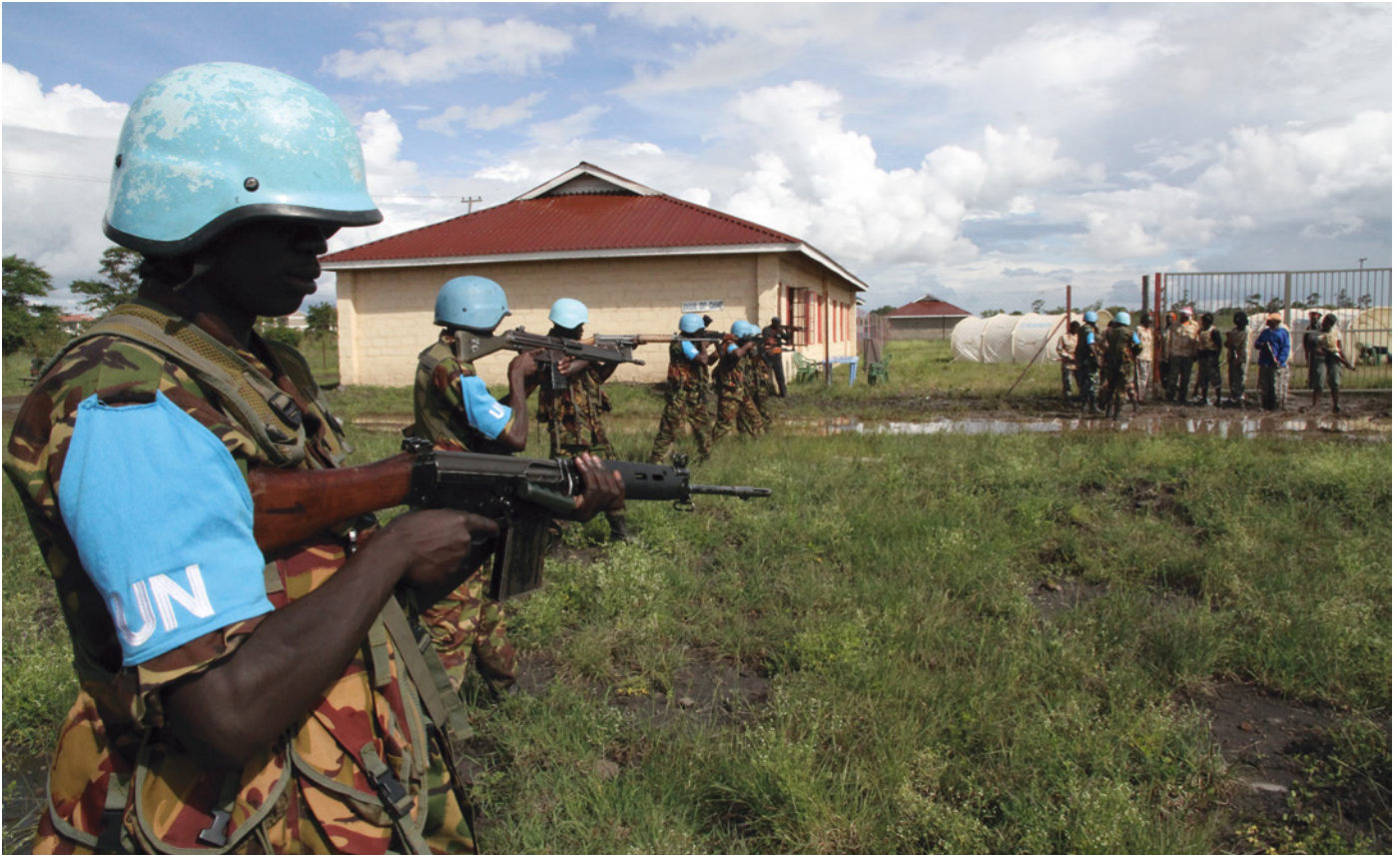
Kenyan Rapid Response Forces undergoing training, 2013.