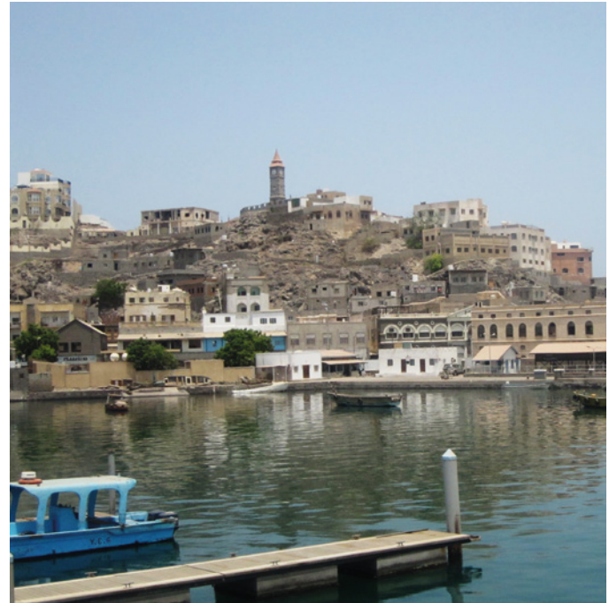
Coast guard cooperation, Port of Aden, Yemen, 2013.

Building legitimate and representative local and state institutions is very important for long-term sustainability of stabilisation efforts. The difficulties and time horizon of building legitimate and effective local institutions and promoting inclusive political processes are often underestimated. These development processes are comprehensive and require patience and the long haul. Against this background, capacity building, through the efforts of i.a. civilian experts and deployed Danish Armed Forces, plays an increasingly important role. A significant