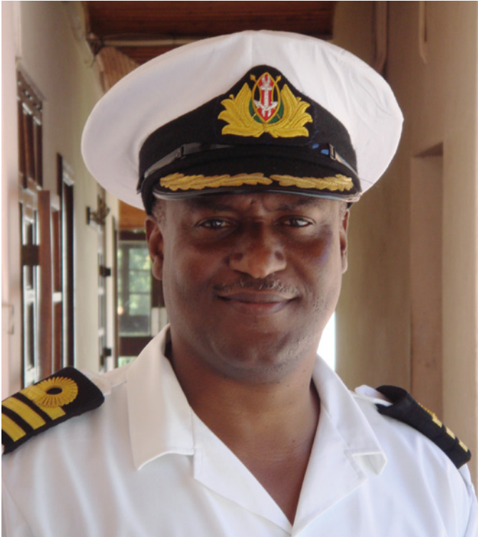
Kenyan Naval Officer, Mombasa, Danish-Kenyan naval cooperation, 2011.

Balkans in the 1990s, the Danish Armed Forces have also maintained security cooperation with the countries in the region, contributing to long-term positive developments for the region's security institutions. Adding to this, the Danish Home Guard has capacities that may be used in stabilisation efforts. The Danish Home Guard has been assigned operational tasks as guards, and has participated in the training and education of security forces.