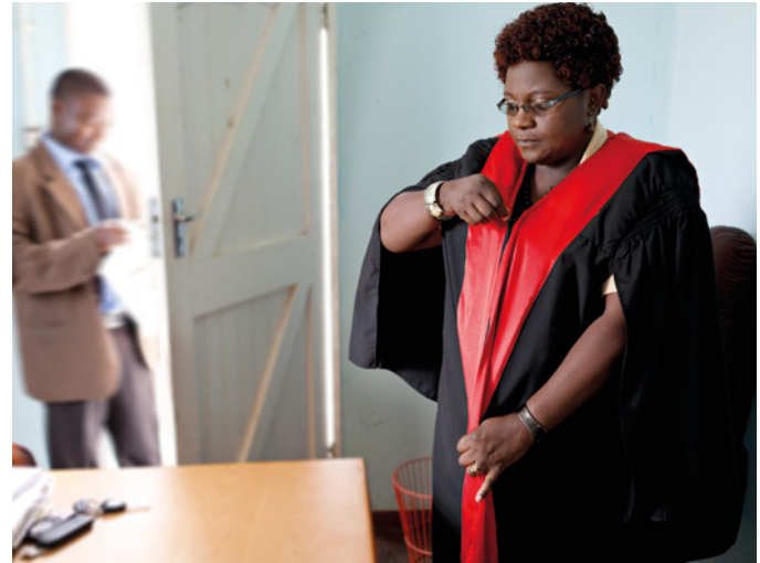
Democratisation in Zimbabwe: Hearing in Magistrates Court in Murewa, 2011.

Within the overall, poverty-orientated development assistance, significant support is aimed at conflict prevention and the promotion of stable and inclusive societies. Among its priority areas, Danish development assistance focusses on stability and protection. This includes the build-up and reconstruction of vital societal institutions, the creation of growth and employment and, more generally, the establishment of the best framework for citizens' inclusion and participation in political life, to foster citizens' trust in the state. For example, surveys conducted in Afghanistan show that job creation and economic