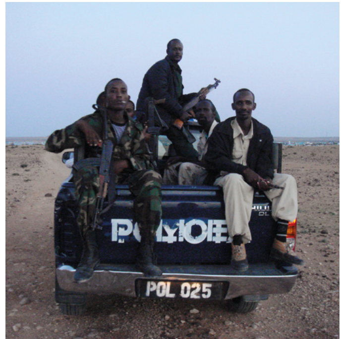
Puntland Special Protection Force , Garowe, Somalia.

The Whole-of-Government structure constitutes the institutional, strategic organisation of the Danish integrated stabilisation engagement. However, as evident from this policy paper, an integrated approach is applied at many other levels and directly between various actors without involving the formal Whole-of-Government Structure.