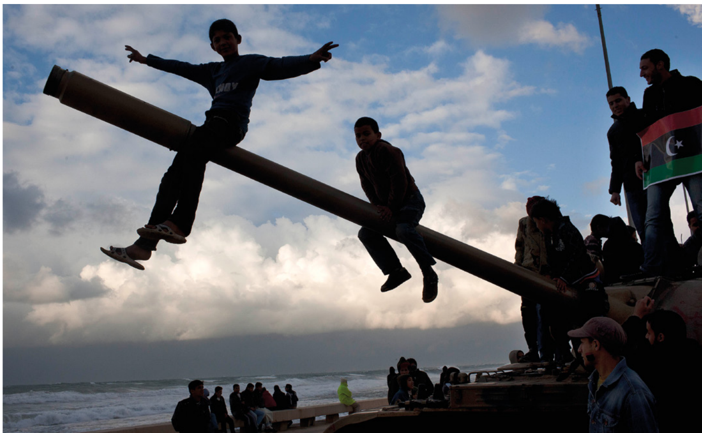
Libyan rebels celebrating Benghazi being under rebel control, 2011.