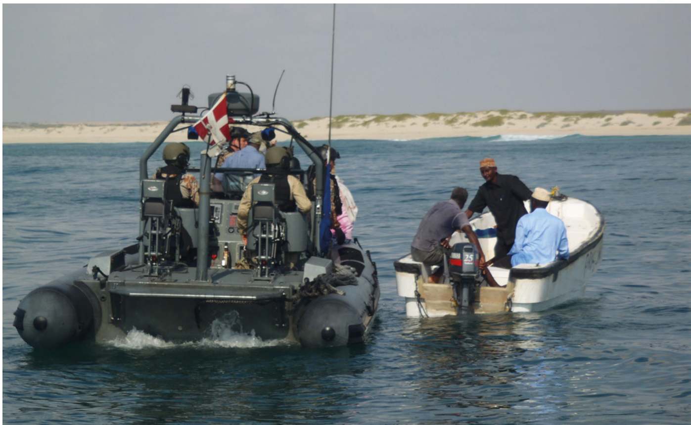
Iver Huitfeldt crew in dialogue with local leaders, Bay of Aden, 2013.