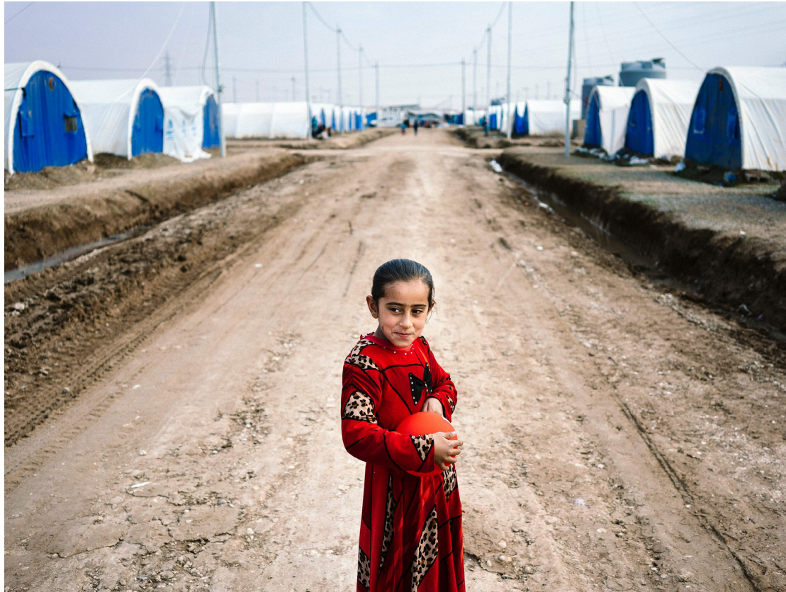
Iraqi girl who has fled Islamic State and who is currently living in Khazer refugee camp.

Peace and security and the challenges faced by countries affected by conflict and fragility take a central position in the Sustainable Development Goals. This is first and foremost the case for Goal No. 16 (peace, justice and institutions), which will have a central position in the Danish engagement. In addition, we prioritise Goal No. 1 (poverty), Goal No. 2 (hunger) and Goal No. 8 (employment) in and around fragile states and situations. We also promote other goals, i.a. in the social area Goal No. 4 (education) and Goal No. 5 (gender equality) through our multilateral initiatives and the civil society cooperation.