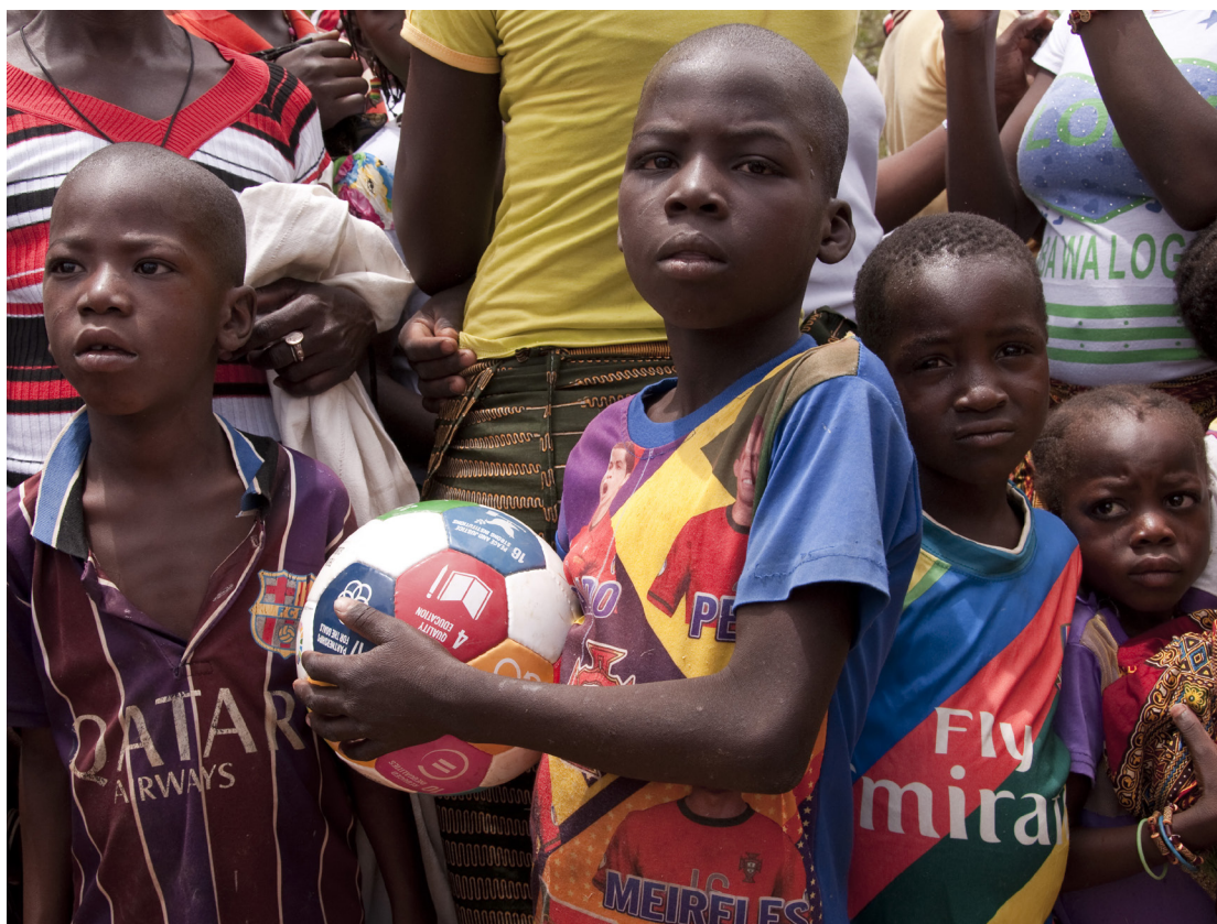
Boy with a Danish designed soccer ball showing the Sustainable Development Goals in Kamsé Village in the Kaya region, Burkina Faso.