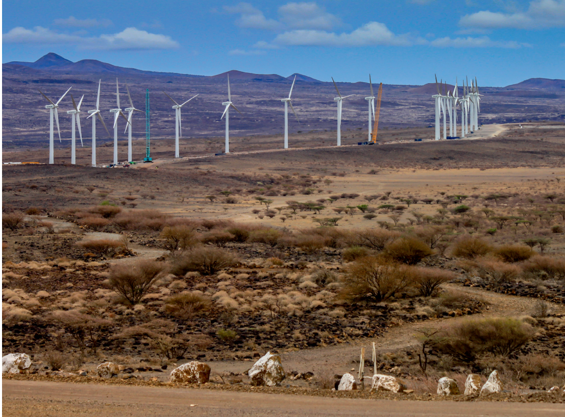
Africa's largest wind farm, Lake Turkana in Kenya, with a extensive Danish involvement. Vestas provides 365 windmills, while the Danish Climate Investment Fund contributes to the financing.

Sustainable global growth is in everybody's interest and a precondition of eradicating poverty. It is a precondition of creating jobs – particularly for young people. The individual must have the opportunity and freedom to realise his/her own potential and take charge of his/her own and his/her family's destiny. Sustainable economic growth is best created through private initiatives in a well-regulated market economy which at the same time strengthens global free trade.