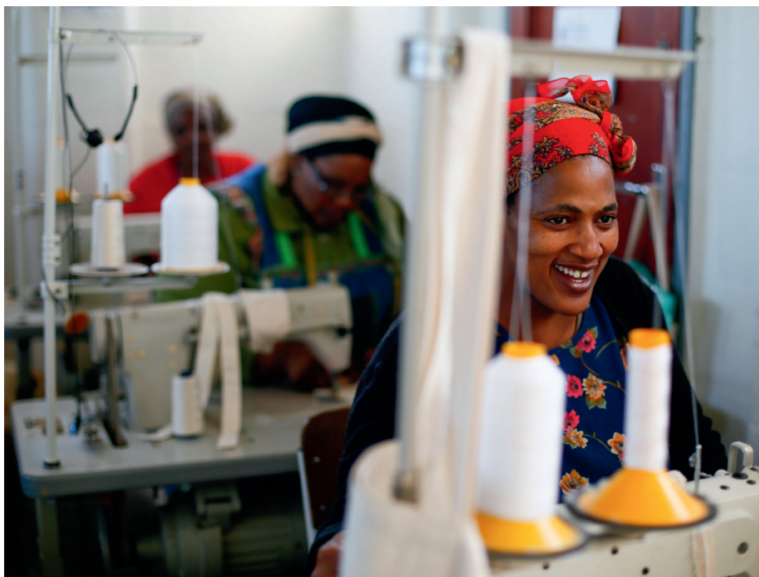
Seamstress who works in the cooperative « Singalaka » that offers sustainable economic opportunities for men and women in South African townships.