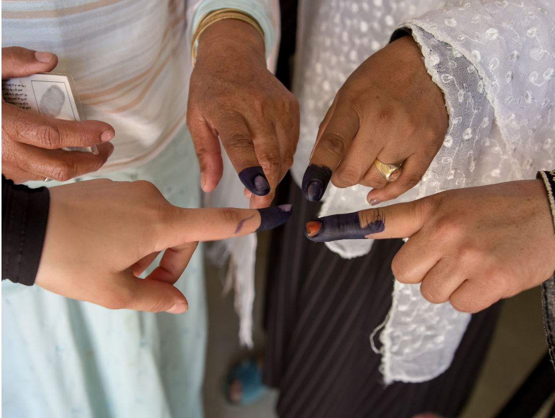
Afghan women who have just voted in the second round of the Presidential election in Afghanistan in 2014.

Denmark will be a significant global defender of human rights, democracy and gender equality. We will promote these values in a wide range of connections, from our contract with private businesses to active participation in UN negotiations in this regard. Human rights, democracy, good governance, the rule of law and gender equality represent a separate priority area of the Danish development cooperation. It is a condition for fulfilling the Sustainable Development Goals and an integral part hereof, particularly Goal No. 5 (gender equality) and Goal No. 16 (peace, justice and institutions), but also Goal No. 1 (poverty) which includes land and property rights. Denmark will support democracies in their right to be democracies, including their right to participate as equal partners in multilateral organisations – an important initiative in this regard is the Neighbourhood Programme for Eastern Europe, which focuses on fragile democracies in Ukraine and Georgia.