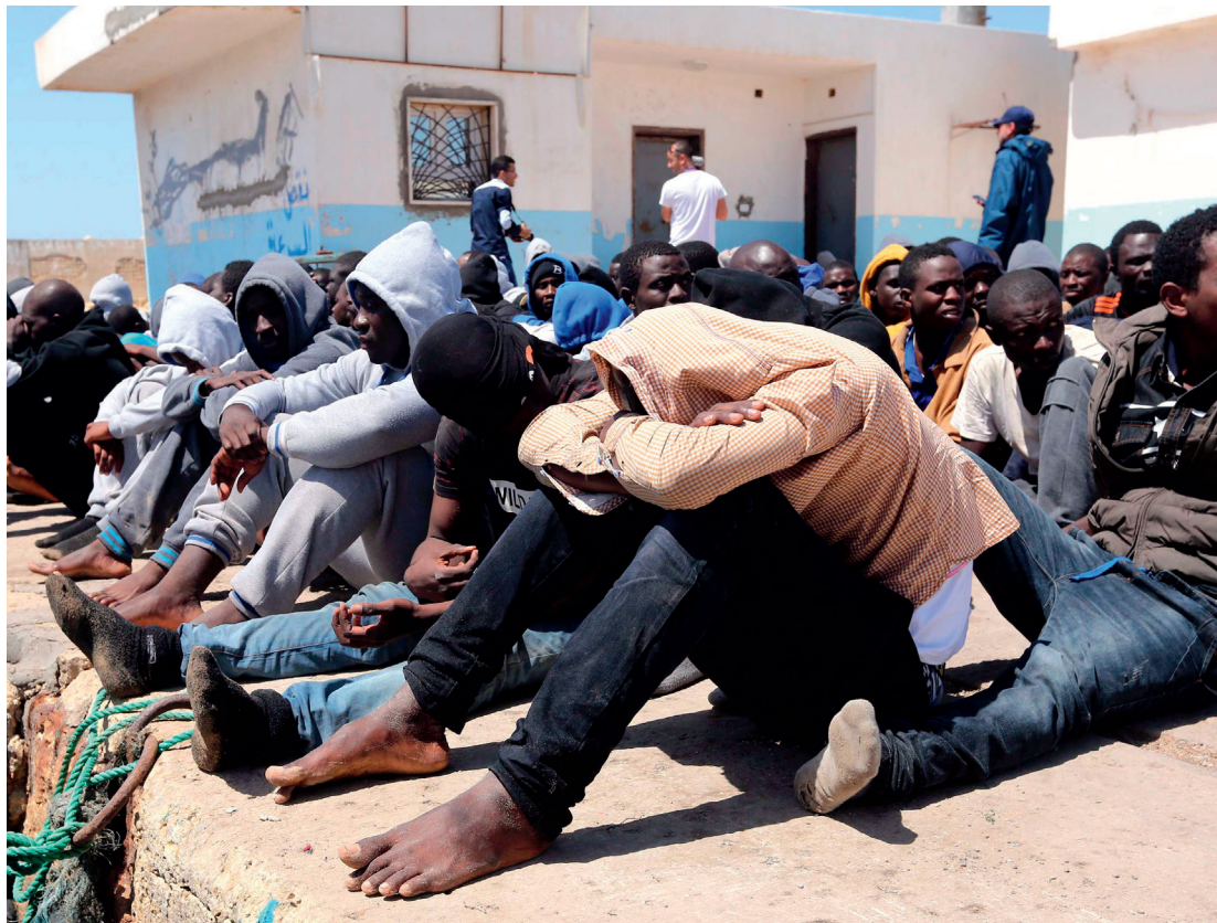
Irregular migrants at the harbour of Tripoli, Libya, after 117 migrants with African origin have been rescued by two coastal boats off Libya's coast.

The effort to stabilise fragile countries and situations and create a favourable, sustainable economic and political development is closely related with managing future migration flows. Especially Goal No. 1 (poverty), Goal No. 8 (growth and employment) and Goal No. 16 (peace, justice and institutions) are central to managing migration together with states' responsibility to readmit their own citizens, which is included in Agenda 2030.