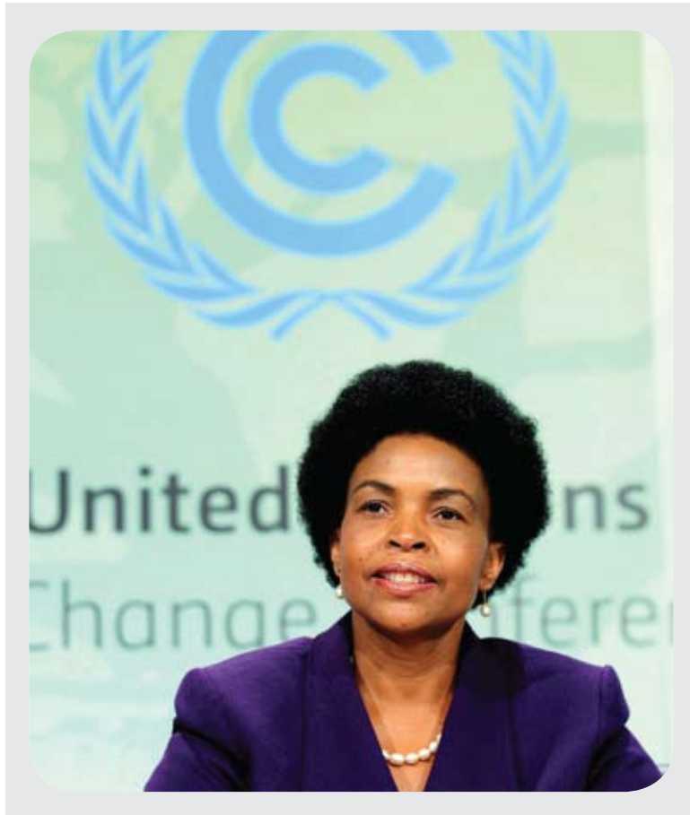
Minister Maite Nkoana-Mashabane