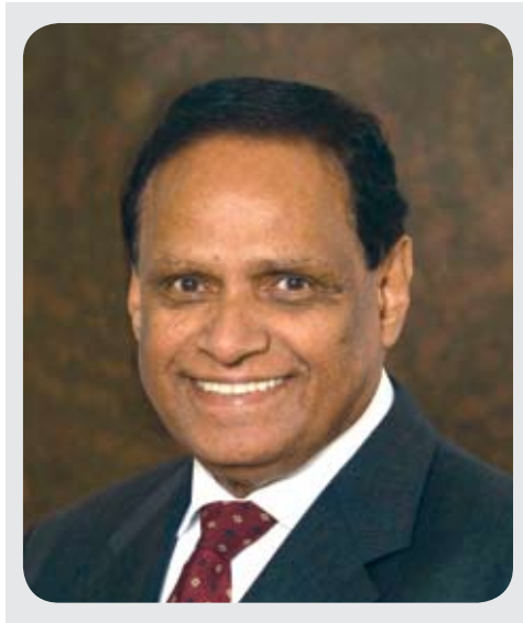
Deputy Minister Ebrahim Ebrahim