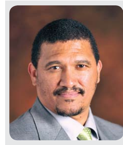
Deputy Minister Marius Fransman

the disbursement of development funding, the African Renaissance and International Cooperation Fund (ARF). The Department of International Relations and Cooperation (DIRCO) is seized with the process of establishing a new fund called the Partnership Fund for Development to replace the ARF, and is in an advanced stage in establishing a dedicated agency for managing all South African outgoing development cooperation programmes. The business case for the establishment of the agency, to be called the South African Development Partnership Agency (SADPA), has been finalised and work is underway to develop an operating framework.